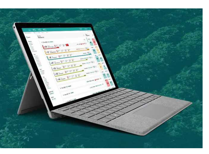
Argus FOCUS enables you to analyze your results batch-by-batch and develop actionable insights