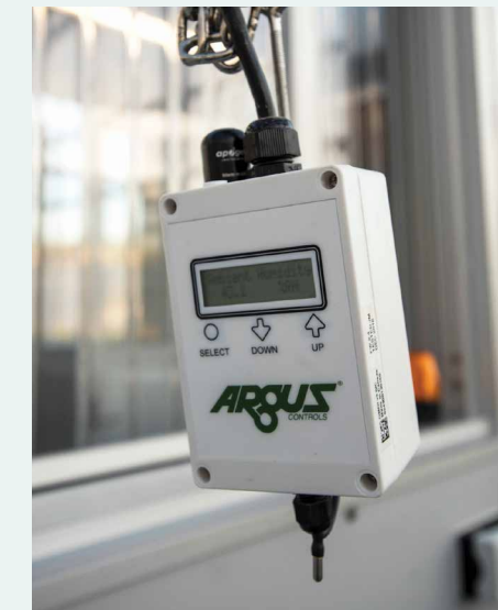
Measuring temperature, humidity, lighting and CO<sub>2</sub>